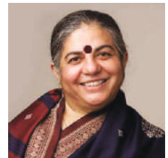
Dr. Vandana Shiva Environmental activist, India